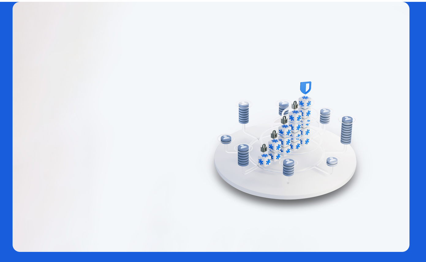
Scalable password sharing